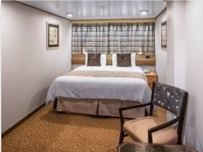
INSIDE FROM $1,589

Please select your stateroom or suite type and room category from the available options.