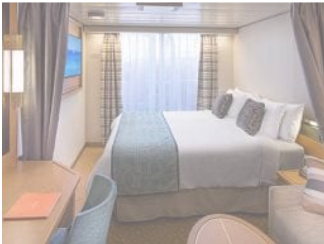
OCEAN VIEW FROM $1,349